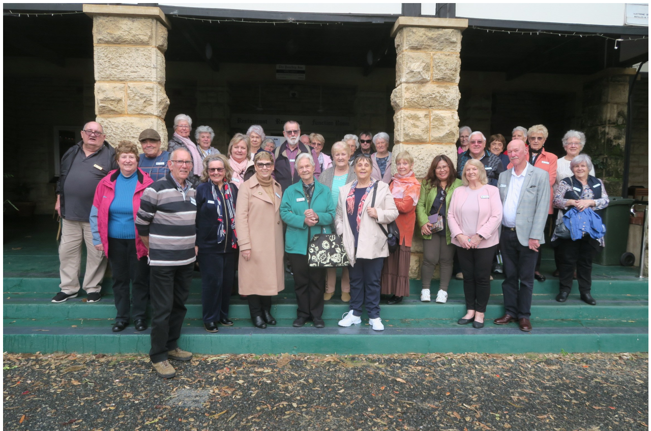
Xmas in July Yanchep Inn . Top left welcoming Party Yanchep Two Rocks Members